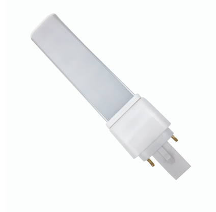
Model : IPL-C03-H108A