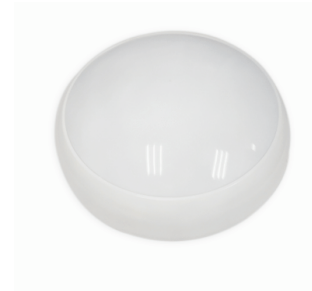
Model : ILR-P18-H108A