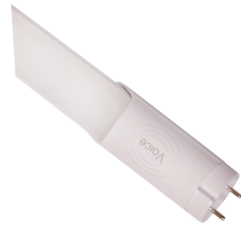
Model : LT-I1218-V108A-NF