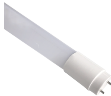
Model:LT-R06 / LT-R12 / LT-R15