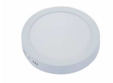
Model : ILR-T08-H108