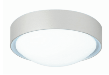
Model : ILR-A06-H108A