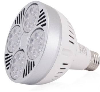
Model : PAR30-A35