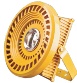
Model : EP-GMD100-H108E