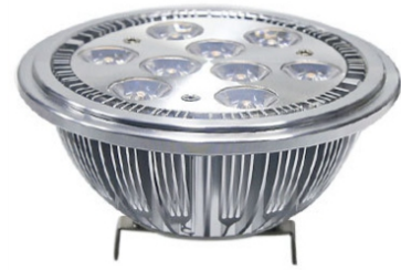
Model : PAR111-15W