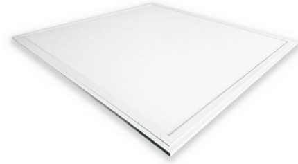
Model : PL606030-N128A