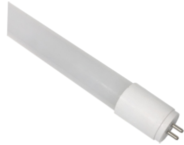
Model:LT-R506 / LT-R512 / LT-R515